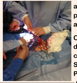
Simulation mannequin in use

Neck cannulation simulation manneguin developed by our coordinators