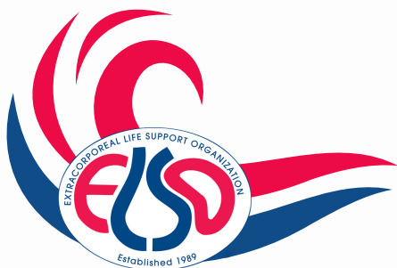
EXHIBIT HALL INFORMATION

Location: Boston Marriott Copley Place 110 Huntington Avenue Boston, MA 02116, US