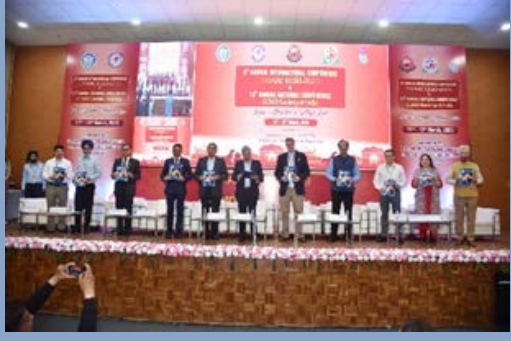
he SWAACELSO 2023 at Ludhiana (India): Glimpses and Remanences